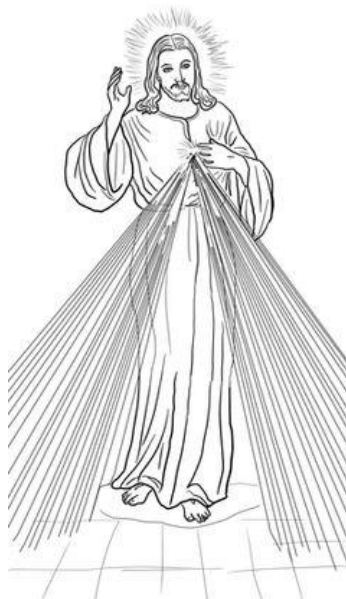
Jesus, I Trust in You

Paint an image according to the pattern You see with the signature: Jesus I trust In you. The two rays denote Blood and Water. The pale ray stands for the Water Which makes souls righteous. The red Ray stands for the Blood which is the life Of souls. These two rays issued forth From the depths of My tender mercy When My agonized Heart was opened By a lance on the Cross. By means of This image I shall grant many graces To souls. It is to be a reminder of the Demands of My mercy, because even The strongest faith is of no avail Without works. Not in the beauty of The color, nor of the brush lies the Greatness of this image, but in my Grace. (Diary: 47, 327, 742, 313)