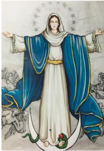
Feast of the Immaculate Conception Holy Day of Obligation

Marriage: See pastor six months prior to wedding